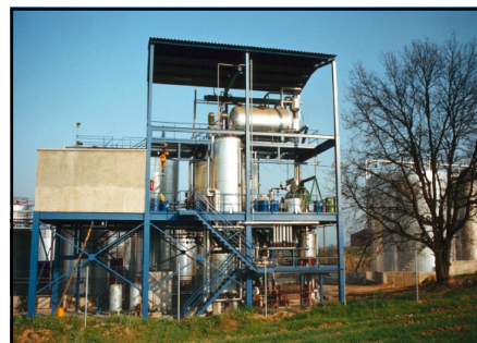
Hydrogenator used to partially hydrogenate vegetable oils to create trans fats

Oh, for the days when fat was fat! Over the years, what we used to think of as a single substance has splintered into a bewildering hodge podge of varieties: saturated fats, monounsaturated fats, polyunsaturated fats, hydrogenated fats, and now trans fats. Many health experts have taken to calling trans fats “killer” fats and warn that they are among the most dangerous foodstuffs we consume. Earlier this year the Bush Administration warned the public to keep trans fat consumption “as low as possible” and encouraged the food industry to decrease the content of trans fats in the food supply. Trans fats are engineered fats produced by an industrial process called partial hydrogenation.